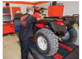
Highly trained service technicians