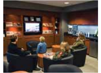
Comfortable customer lounge

New Honda Powerhouse dealerships are opening across Canada; visit honda.ca to find one near you.