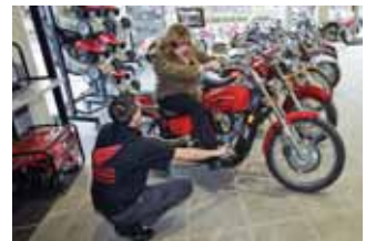
Knowledgeable sales staff