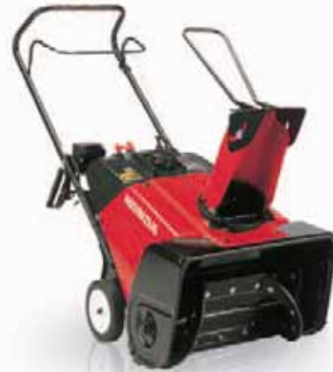
HS621CS Model Shown

ALSO AVAILABLE WITH 120 VAC ELECTRIC START - HS520K1CS