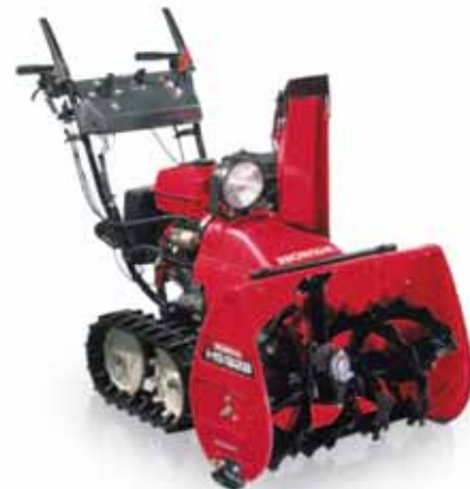
HS928TCD Model Shown