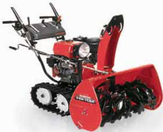
HS1132TCS Model Shown

ALSO AVAILABLE WITH 12 VDC ELECTRIC START - HS724TCD HS724TCD COMES WITH WORK LIGHT AND ELECTRIC JOYSTICK CHUTE CONTROL