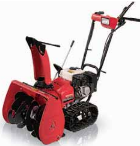
HS622TCS Model Shown