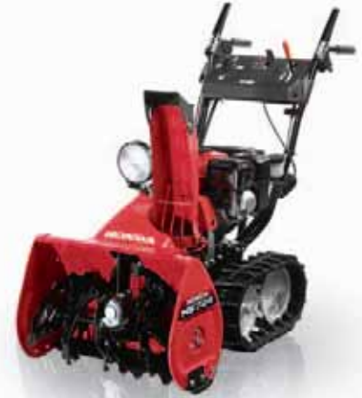
HS724TCD Model Shown

ALSO AVAILABLE WITH 120 VAC ELECTRIC START - HS622TCS